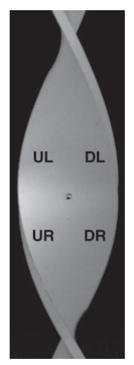
Fig. 2. The quadrants of a spinner segment face different directions, which are labeled U, D, R, and L to indicate up, down, right, and left, respectively.

curvatures, so their focal lengths are approximately the same size but opposite sign. Magnification in terms of the magnitude of the focal length fand object distance d_{obj} is