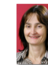
Michele Dougherty Imperial College London